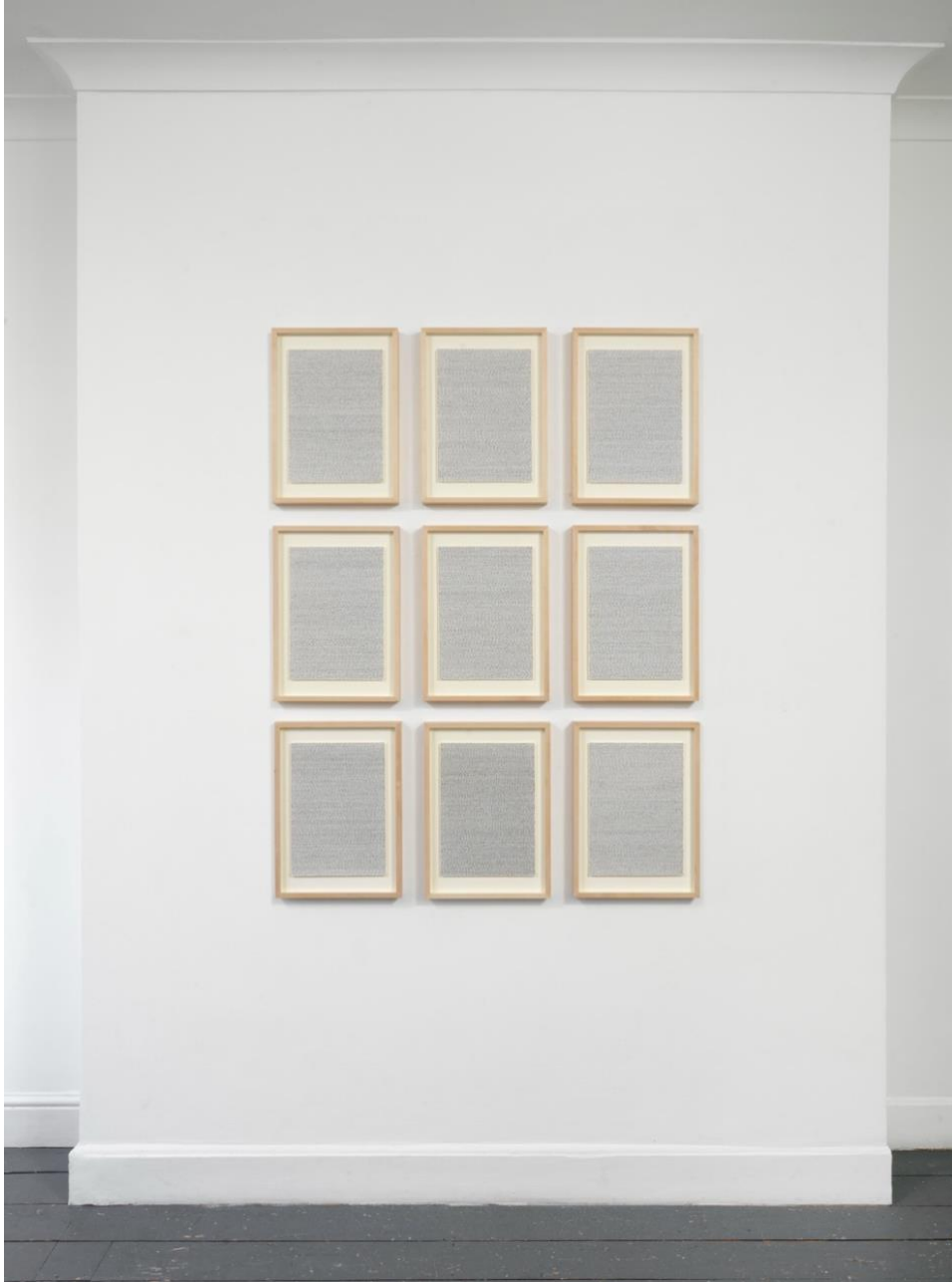
After Opalka: Searching for the spiritual in the ruins of root 2 - the first quarter of a million places 9 drawings (portrait format), comprising a digital articulation of \sqrt{2} , to 253,382 places. 0.25 mm pen & black ink on 300 gsm Heritage Rag paper 233.5 x 330 mm (each) 2023 € 3.000 incl. frame & VAT (each) | €25.000 incl. frame & VAT for the set of nine