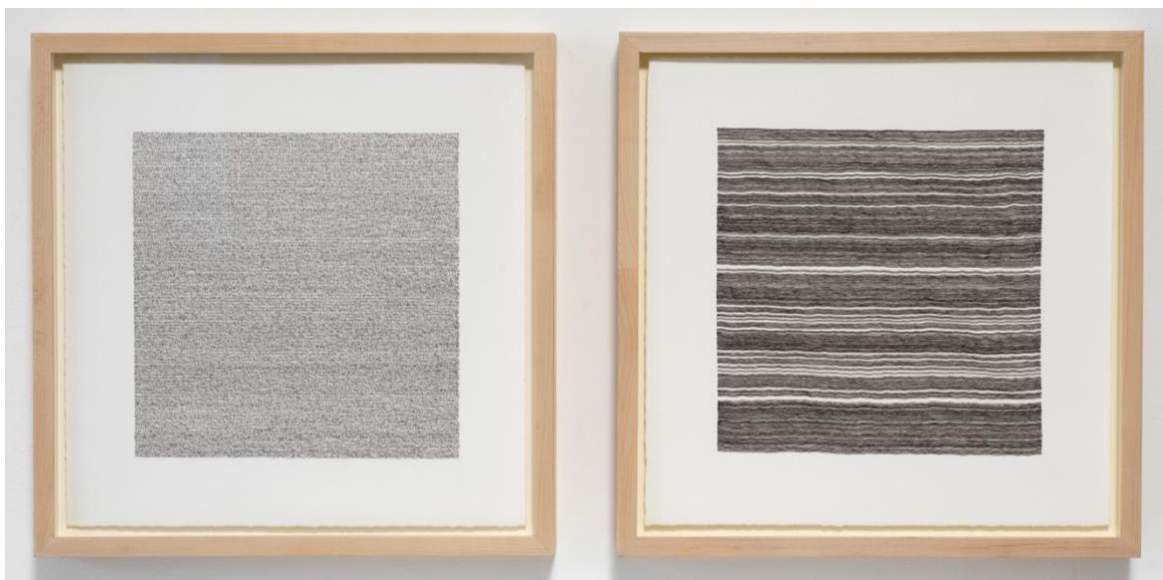
Three homages to Euler number 1 - The Euler-Mascheroni constant gamma ( \gamma ) to 16,875 places 2 drawings, 10 pens, erased pencil & black ink on 300gsm Heritage Rag paper 297 x 297 mm (each) 2023 € 3.000 incl. frame & VAT (each)