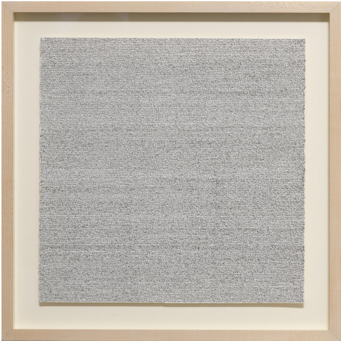
Three homages to Euler number 3 - Euler's number e, to 34,845 places 1 drawing, 0.25 mm pen & black ink on 300 gsm Heritage Rag paper 297 x 297 mm 2024 € 3.300 incl. frame & VAT (each)