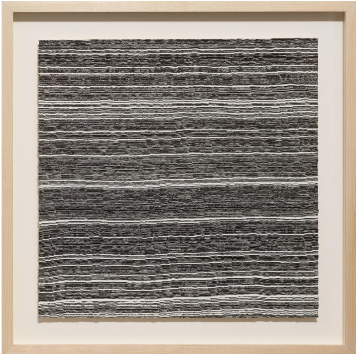
Three homages to Euler number 2 - The Euler-Gompertz constant delta ( \delta ) , to 391 places 1 drawing, 9 pens, erased pencil & black ink on 300 gsm Heritage Rag paper 297 x 297 mm 2025 € 3.300 incl. frame & VAT