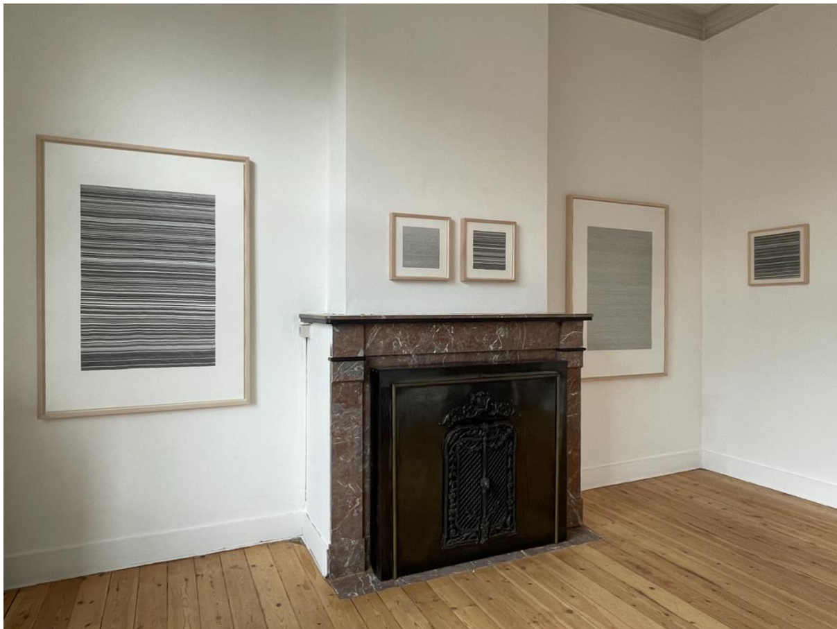
Installation view at Patrick Hiede Contemporary Art

Gallery hours: Thu-Sat, 1-7 PM or by appointment Avenue Van Volxem 333, 1190 Forest – Brussels, Belgium